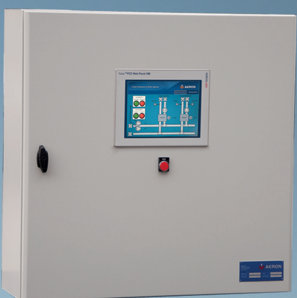
AERON® Control Panel with PLC system