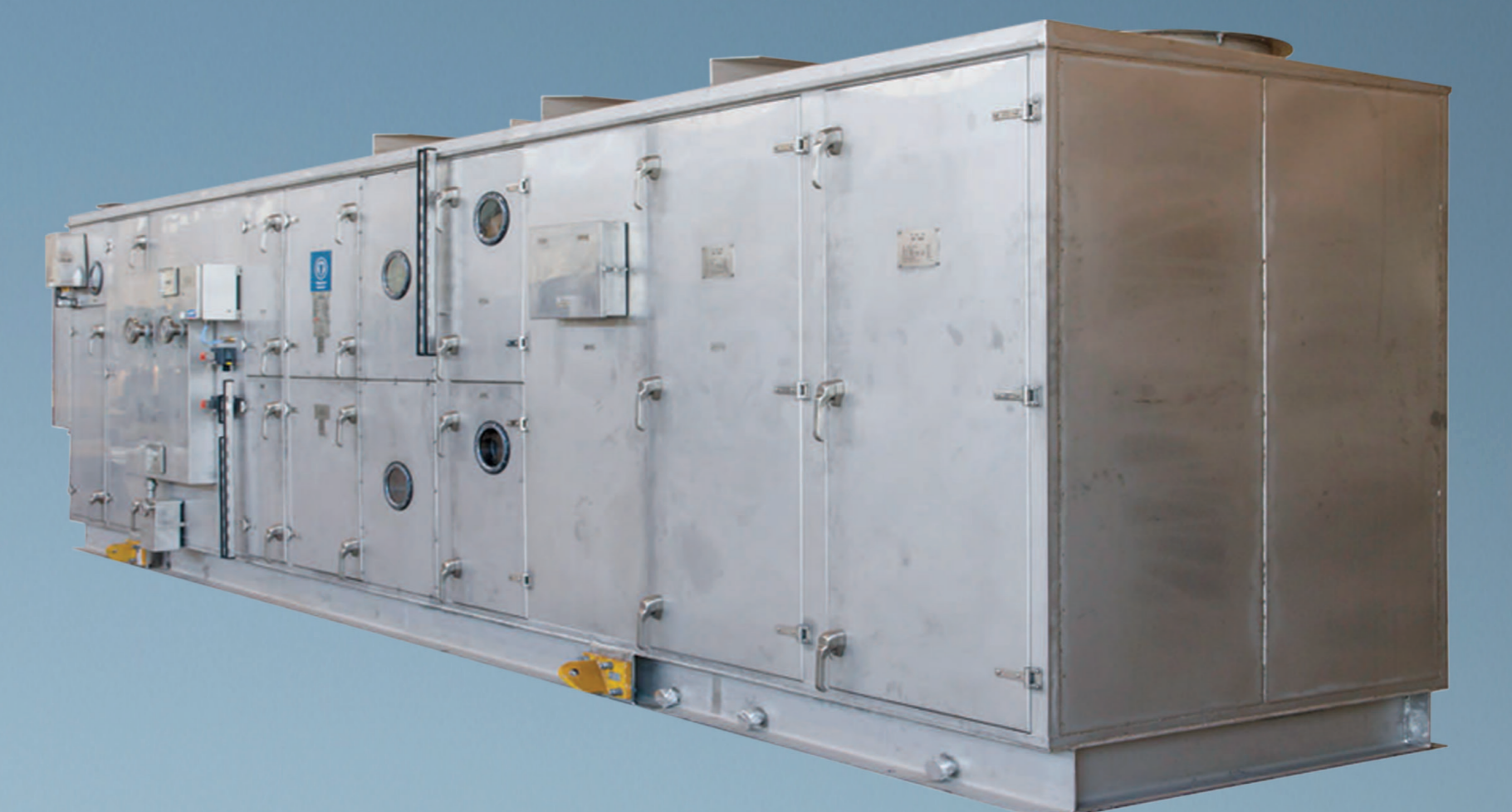
Offshore Air Handling Unit in stainless steel

AERON HVAC-R Products for Marine & Offshore Industry